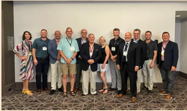
SEDC Florida Caucus