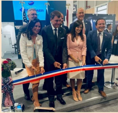
Paris Air Show