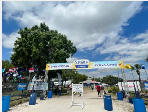
Sun N Fun Aerospace Expo