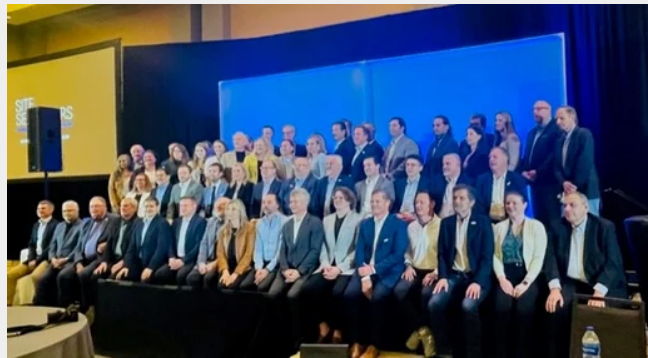
Site Selectors Guild 2023 Annual Conference