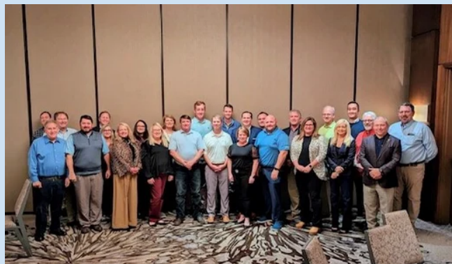
SEDC Fall Meeting, Alabama

MarketWatch Business Summit Tuesday, 12/6!