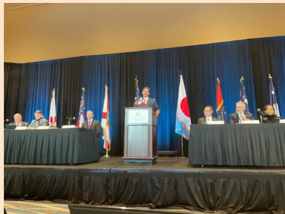
Governor DeSantis welcoming the 44th Annual Joint Meeting Attendees