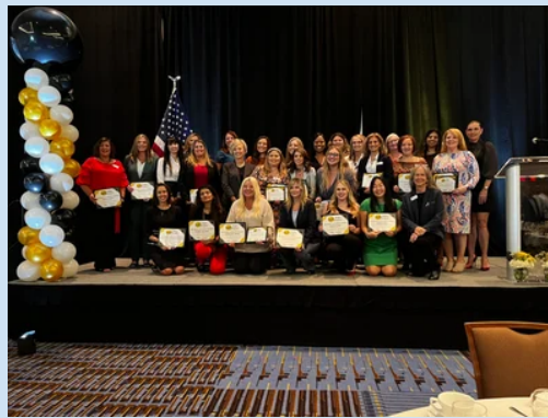
Influential Women in Business 2022 Honorees