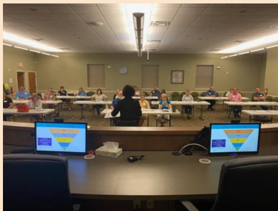
DeBary Citizens Academy