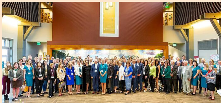
The Inaugural Hungarian Summit Opening Ceremony, Cici and Hyatt Brown Museum of Art, MOAS.