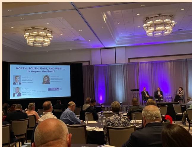
Area Development Consultants Forum 32