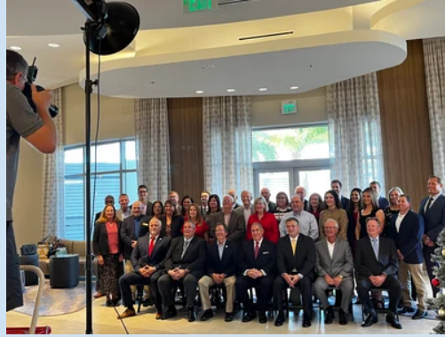
Behind the Scenes: taking the Annual Board of Directors photo