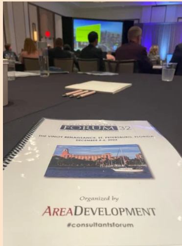
Area Development Consultants Forum 32