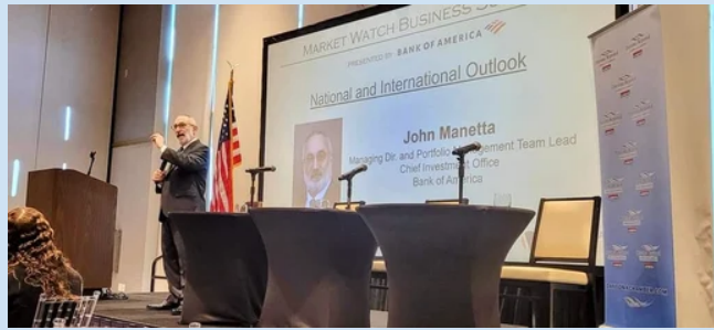
Market Watch Business Summit