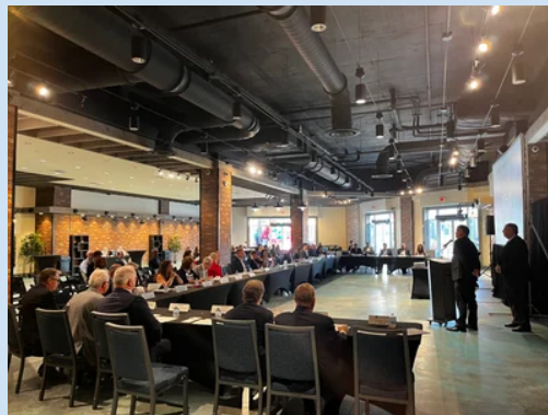
Board of Director's meeting business agenda, approving our 2023 budget