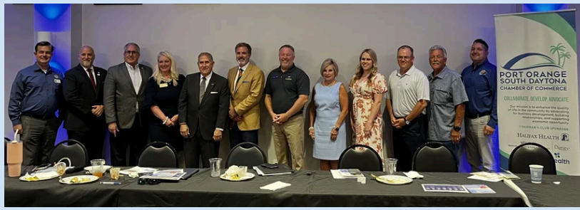
Port Orange South Daytona Economic Development & Governance Council Meeting