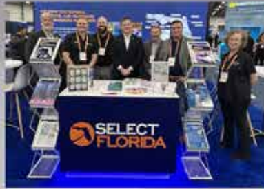
National Business Aviation Association