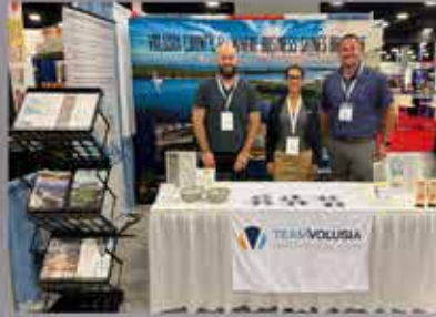
America's Food & Beverage Show