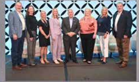
SEDC Site Selection Summit