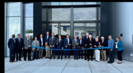
Boeing Daytona Beach Ribbon Cutting, Cici & Hyatt Brown Center for Aerospace Technology, Embry-Riddle Research Park

Boeing Daytona Beach cut the ribbon on their new engineering center at the Embry-Riddle Aeronautical University Research Park, a project leaders say will bring hundreds of high-paying jobs and a major economic boost to Volusia County. The 65,000-square-foot facility, located inside the Cici and Hyatt Brown Center for Aerospace Technology, will support Boeing's Defense, Space and Security programs. Company officials announced about 400 new technical and engineering jobs are expected to come with the opening.