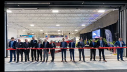
AURA AERO Ribbon Cutting

The AURA AERO ribbon cutting was held for their 11,000 sq. ft facility, at the Embry-Riddle Research Park, which will serve as their U.S. headquarters and first production site, hosting the North American delivery and customer support center for the INTEGRAL program and lay the groundwork for the company's hybrid-electric ERA aircraft. This is the first of two new locations for the company in Volusia County, stemming from a relationship Team Volusia started with AURA AERO in 2023. Projected to break ground in late 2026 or early 2027, the second project will be a 500,000 sq. ft. manufacturing and assembly plant and U.S. headquarters, at the Daytona Beach International Airport, which will create more than 1,000 high-paying jobs.