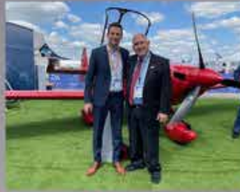
Paris Air Show