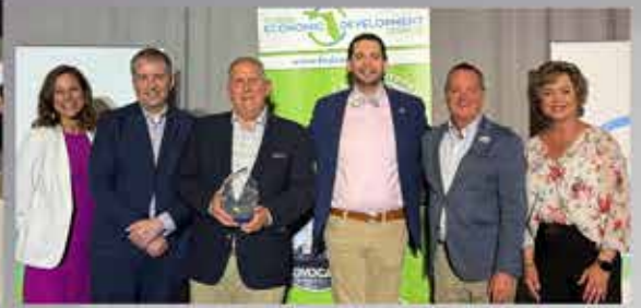
FEDC Annual Conference