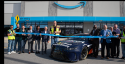
Amazon Ribbon Cutting