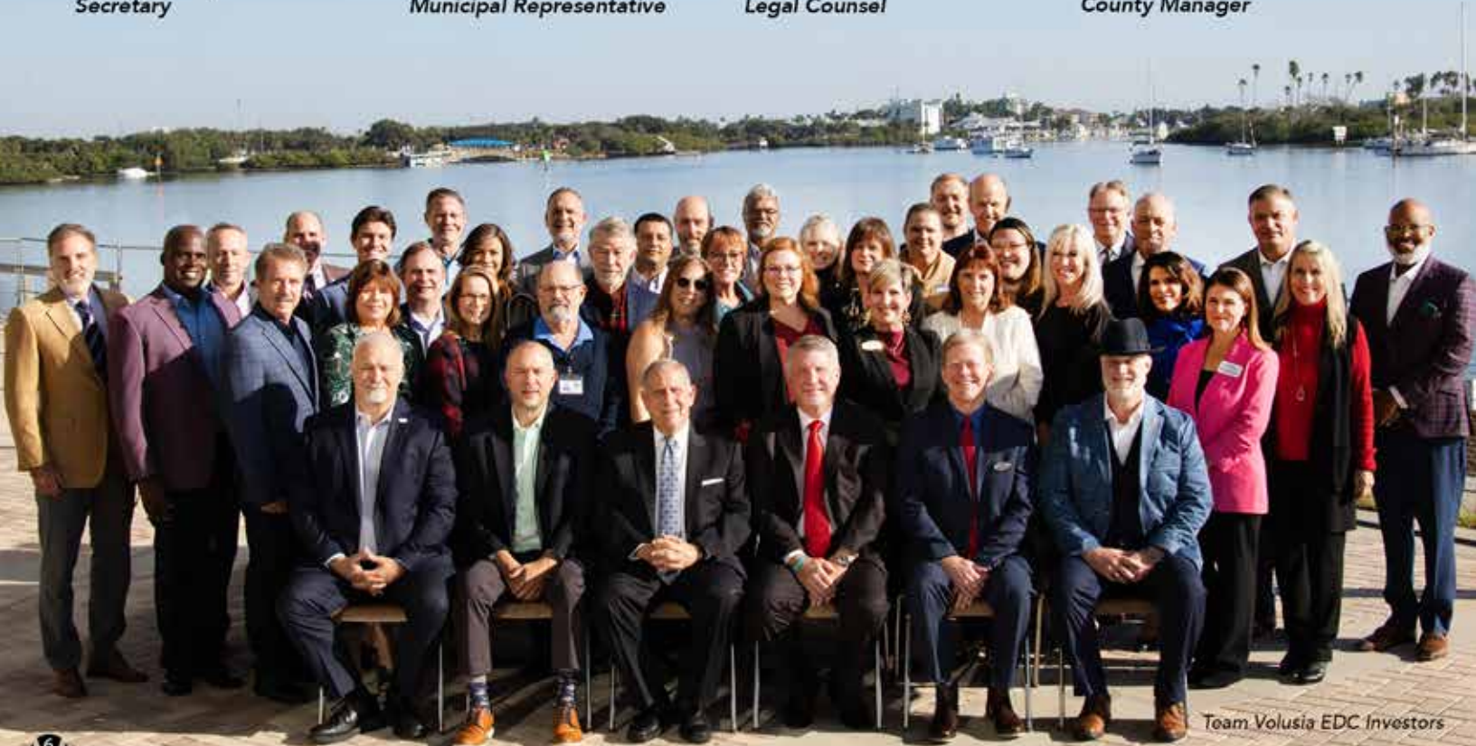
Team Volusia EDC Investors